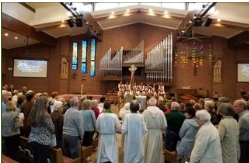
Joint liturgy procession and potluck