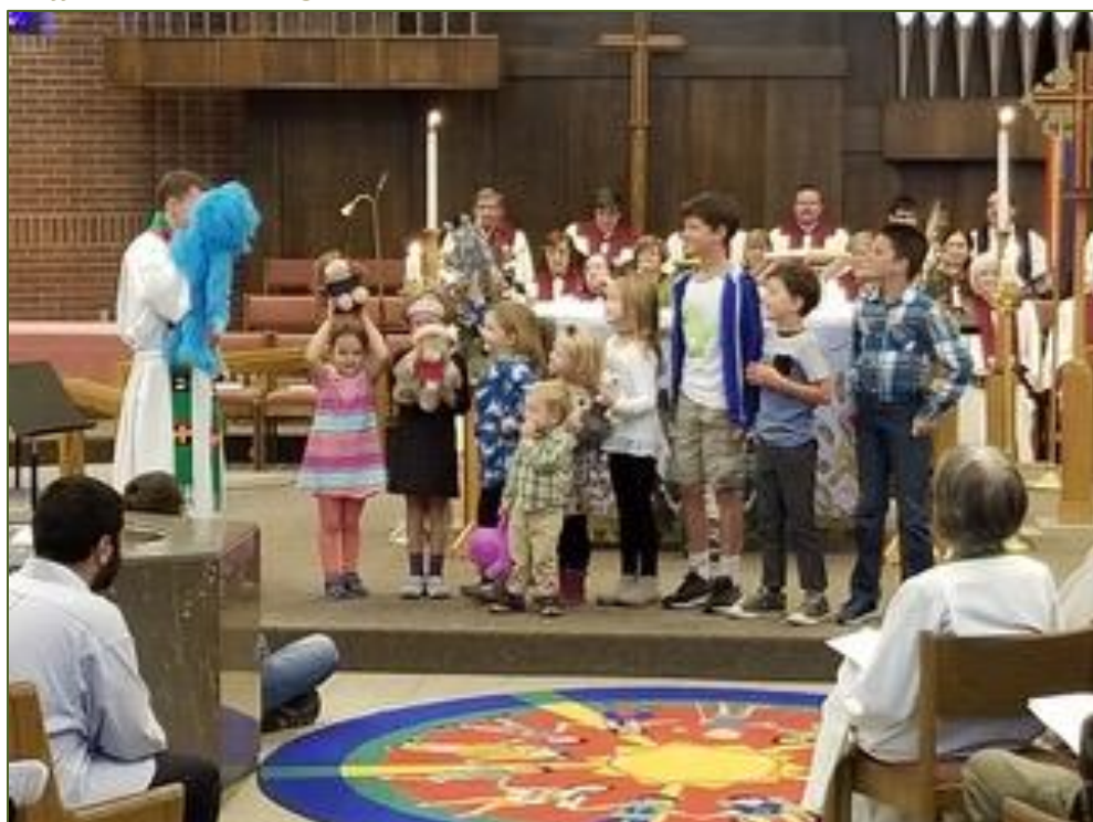
Stuffed animal blessing

A joint liturgy of Sacred Creation and the Feast of St. Francis was held on Sept. 30th. Mary of Magdala, Trinity Lutheran and St. Paul's Episcopal shared in the planning and presiding of this mass. People sent pictures of their pets for a slideshow, virtual blessing of the animals. The potluck following the liturgy was a good time of fellowship.